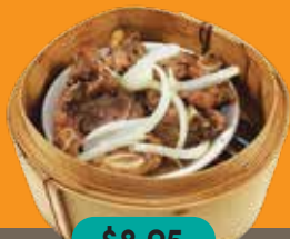
Chicken feet with black bean sauce